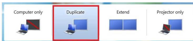
Windows System Display Mode

Please see reverse side for additional instructions.