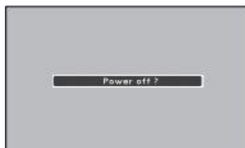
Power Off Screen