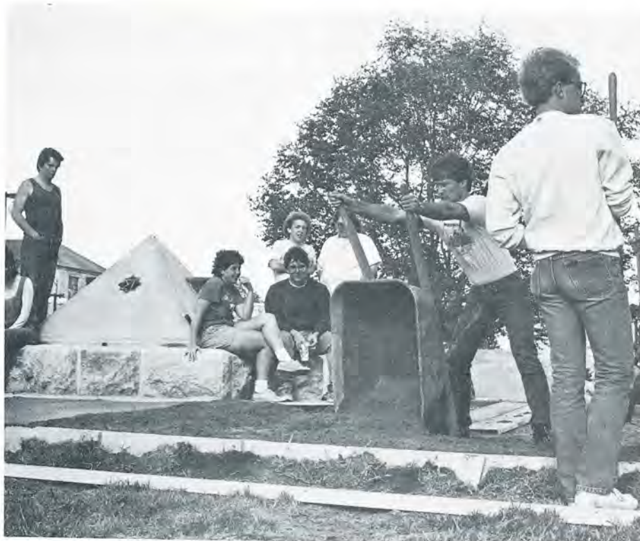
The old Sigma Tau pyramid got a new resting place in March when it was moved from a site near Seaton Hall to one next to Durland Hall. Taking on the relocation project were members of the student chapter of Associated General Contractors.