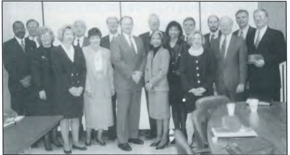
Representatives of K-State, the College of Engineering and Deere & Company gather to commemorate the initiation of the partnership between the college and the company in February.

To Deere it means a closer working relationship with the school that can provide Deere with an advantage in identifying and recruiting top engineers for its co-op and summer training programs. It also gives Deere an opportunity to participate in developing course content that compliments its systems and technologies.