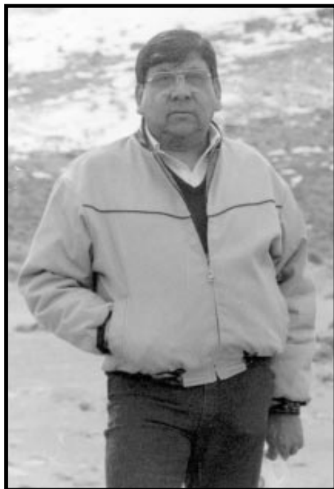
Aragon works toward environmental clean-up without cultural conflict.

necessarily reflect the views of Earth Medicine .